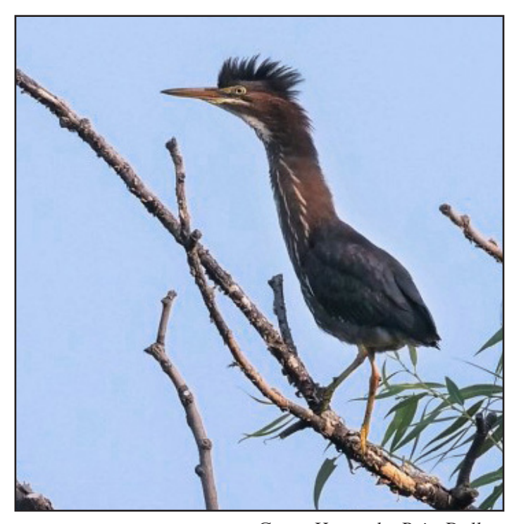
Green Heron, by Britt Dalbec

Details : 10–2:00 pm. Join the CNC team of spotters to count thousands of raptors and other migrants including songbirds, gulls, and other southbound migrants that follow the St. Croix/Mississippi River Flyway south to their wintering grounds. Program fee: Free. For information, call 651-437-4359.