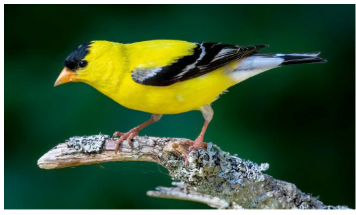
American Goldfinch