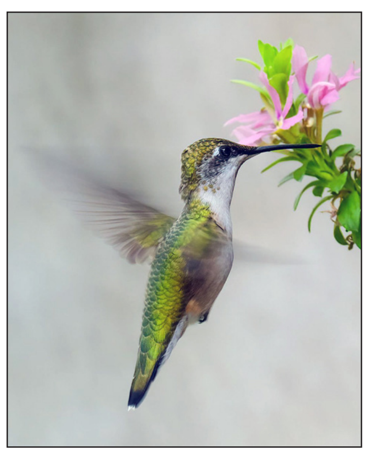
Ruby-throated Hummingbird

however, can have a major impact on bird populations, especially those with shorter lifespans, such as passerines. In California, several consecutive years of droughty and hot conditions have raised concerns that many species that are already rare and/or declining may be pushed over the edge.