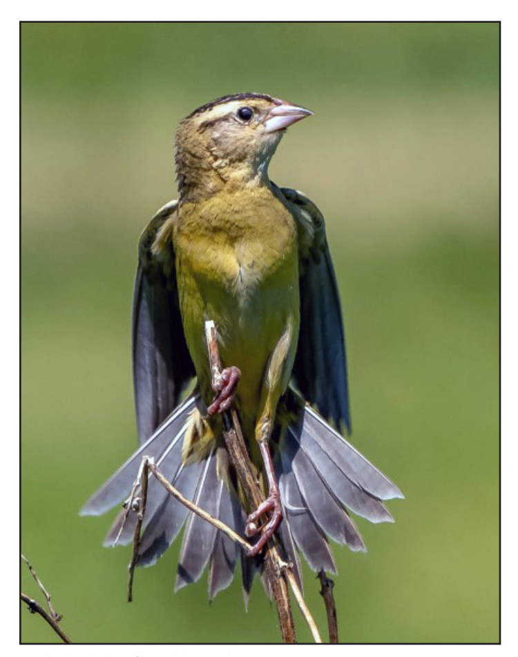
Bobolink, by Gerald Hoekstra

Details: 10 am–12 pm. Woodpeckers have many fascinating adaptations that help them find food and build homes in trees. Learn how to identify woodpeckers and go on a hike to search for birds and signs in our woods. Three Rivers Young Birders Club is for ages 9-12, helping you discover the wonder of birds and meet other kids interested in them too. Fee: $5.00. Free for Young Birders Club members (discount applied at checkout). Reservations required by two days prior. Call 763-559-6700 to register.